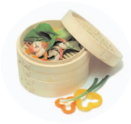
WK-14690 3 Piece Set 10" Bamboo Steamer

UPC Code: 6-44157-14690-9 Master Case: 6