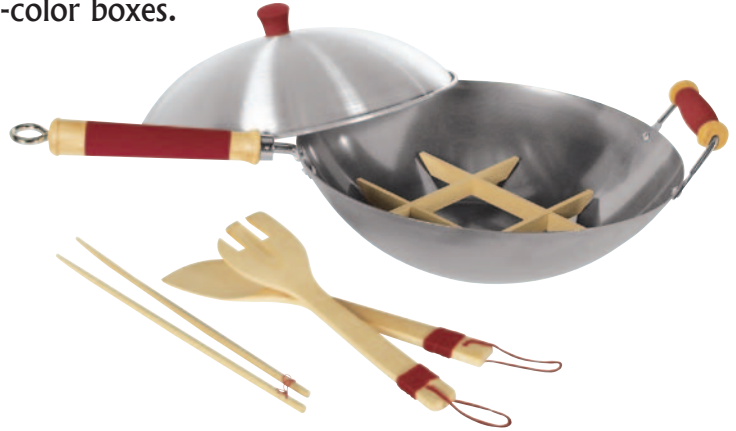
WK-14017 "Easy-Grip" Silicone/Wood Handle 14" Professional 7-piece Carbon Steel Wok Set UPC Code: 6-44157-14017-4 Master Case: 4