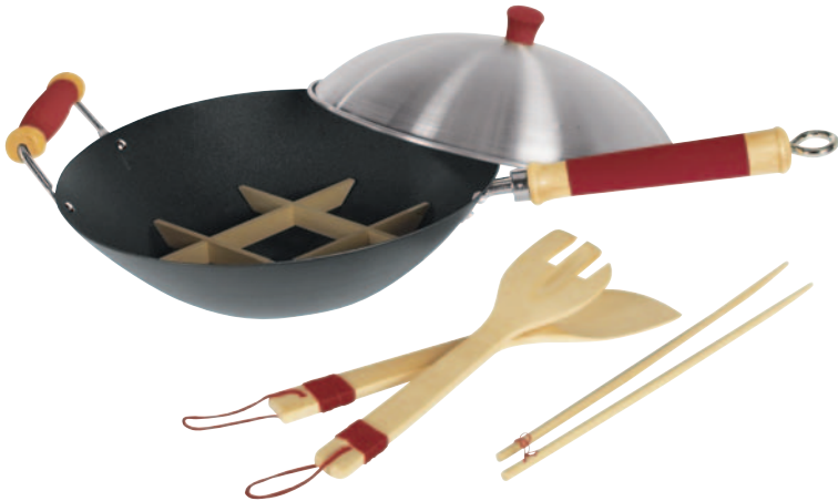
WK-14117 "Easy-Grip" Silicone/Wood Handle 14" Professional 7-piece Non-Stick Wok Set UPC Code: 6-44157-14117-1 Master Case: 4

All Wok Sets come packed in durable corrugated 4-color boxes.